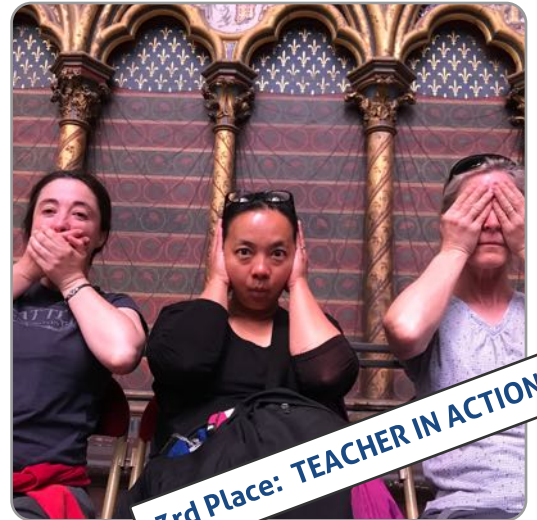
3rd Place: TEACHER IN ACTION

See our other photo contest winners and more inside this newsletter.